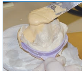
5. Using fast-set stone, pour one side, cover with damp paper towel, allow to set.