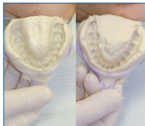
4. Simultaneously capture maxillary/mandibular impressions in as little as four minutes.