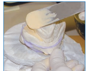
6. Pour other side and allow to set. Fabricate trays with vacuum former and easily trim with Tray Magic™ Trimmer.