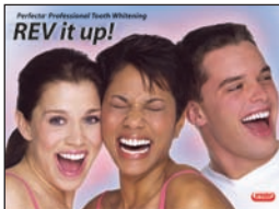
REV! Poster 8698750

Call Premier Dental at 610-239-6053 for the availability of promotional material.