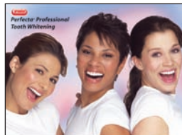
Premier Poster 8698755