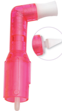
Soft/Long White Cup Long Tip