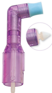
Firm/Short Blue Cup Short Tip