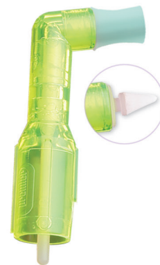
Firm/Long Green Cup Long Tip