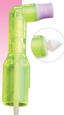
Soft/Short Purple Cup Short Tip