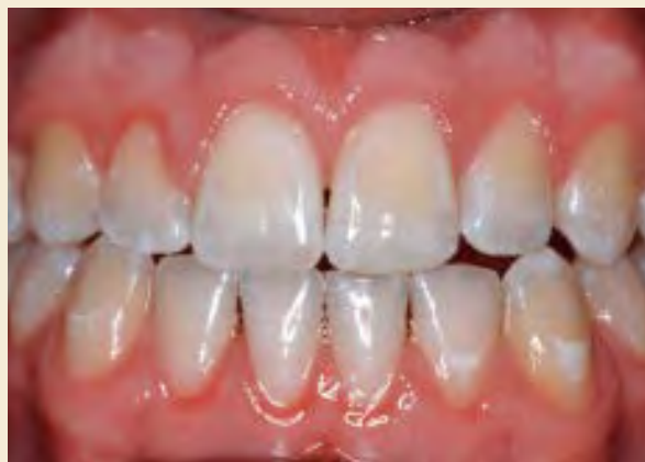
Fig 2e Three-month follow-up view after enamel microabrasion and restoration of the left canine.