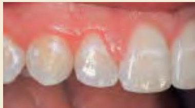
Fig 2b Right lateral view of the decalcification.