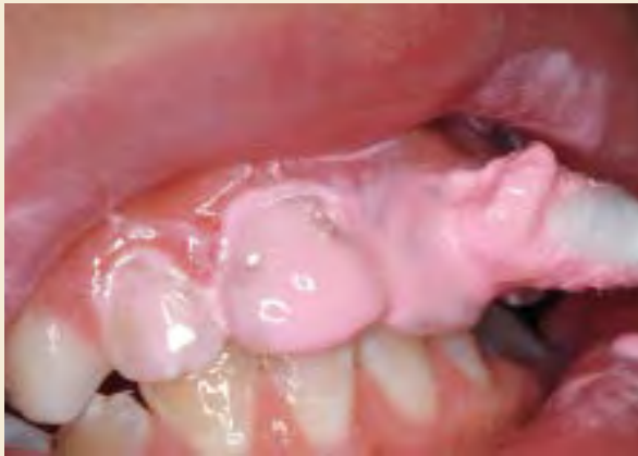
Fig 1d Application of fluoride/calcium phosphate gel.