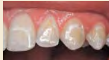
Fig 2c Left lateral view. Note the caries lesion on the canine.