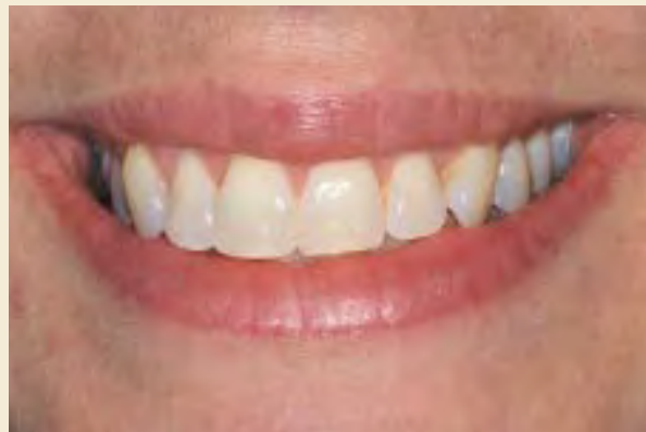
Fig 4b Smile view 27 years after microabrasion and 2 years after bleaching.

than the lateral incisors. Although the appearance of these incisors could have been substantially improved with bonded resin-based composite restorations, it was decided that the enamel defects were superficial enough to be eliminated rather than covered up. 15