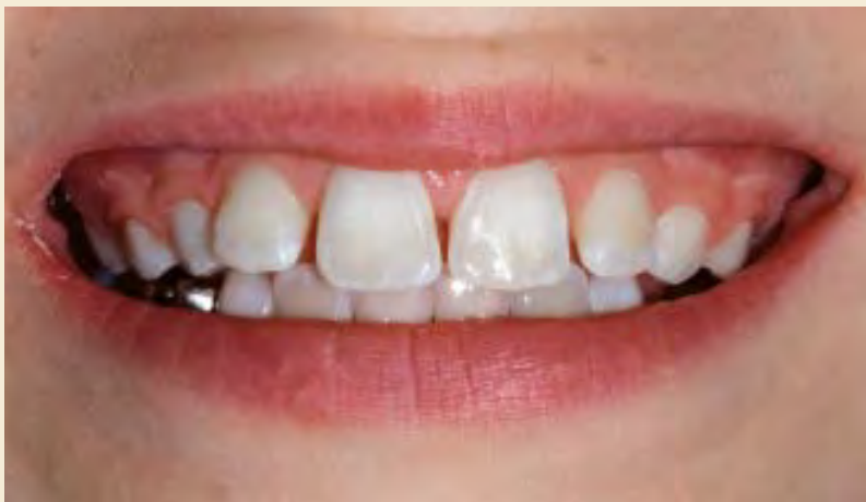
Fig 3d Three months after enamel microabrasion, the enamel texture appears normal.

therapy (Figs 2a to 2c). 14 There was a caries lesion associated with the decalcification on the maxillary left canine. The maxillary premolars also showed facial decalcification spots. A small shear fracture was noted on the maxillary left first premolar, which may have occurred during orthodontic bracket removal (Fig 2c). That fractured region was smoothed with a fine-tipped diamond bur. White decalcification areas were also seen on some mandibular teeth, but none were noticeable when the patient spoke or smiled, and none showed associated caries.