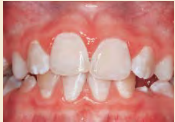
Fig 1e Immediate posttreatment view.