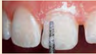
Fig 3b Low-speed diamond bur used to initiate enamel microreduction.