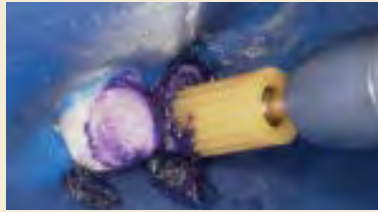
Fig 1b Microabrasion compound applied with the rubber applicator tip.