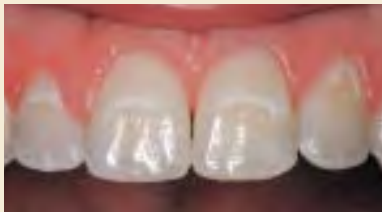
Fig 2a Decalcification due to inadequate oral hygiene during orthodontic treatment.