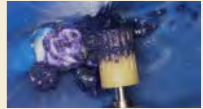
Fig 1c Side flutes were also used for application.