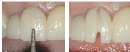
770.8Z Round-End Taper Section and Remove