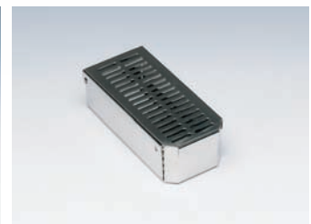
9010901 Accessory Cassette 1.5" x 3.5" x 1.0" (3.81cm x 8.89cm x 2.54cm)