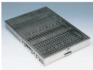
9010924 Mark IV (12 or 24 Instruments) 8.0" x 11" x 1.50" (20.32cm x 27.94cm x 3.81cm)