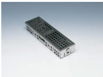
9010904 Mark I (4 or 8 Instruments) 2.5" x 8.5" x 1.5" (6.35cm x 21.59cm x 3.81cm)