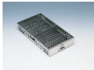
9010908 Mark VI (8 or 16 Instruments) 4.5" x 8.0" x 1.25" (11.43cm x 20.32cm x 3.18cm)