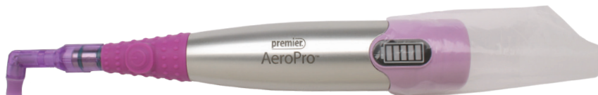
Shown - fully assembled CDC-compliant handpiece

*Use only AeroPro® Disposable Barriers (F) for CDC-compliance