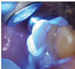
3-second tack cure