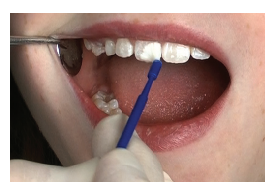
Enamel Pro Varnish is easy to apply and aesthetically pleasing.

Thin layer application & appealing flavors ensure patient acceptance