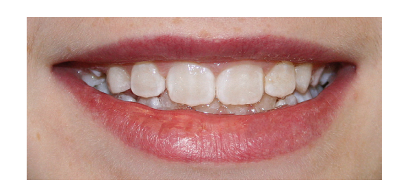
View Easy Application Video www.youtube.com/PremierDentalProduct